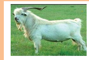
Recruiting best breed